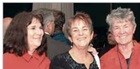
Presenters from Phoenix House's Women's Services: "Happy to be here and share our experiences in treating women with learning disabilities."

Choir, young men and women in residential treatment. The TC philosophy unites individuals in a common purpose; it is pure inspiration, pure poetry and a creed to live by. The night has just begun!